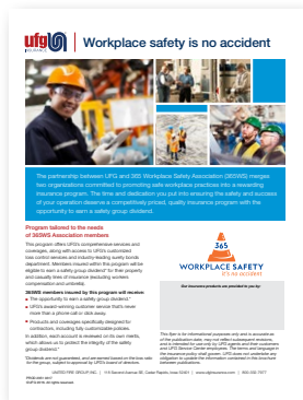
PROD-2351, a consumer sales flyer, is available online at ufgmarketingsolutions.com .